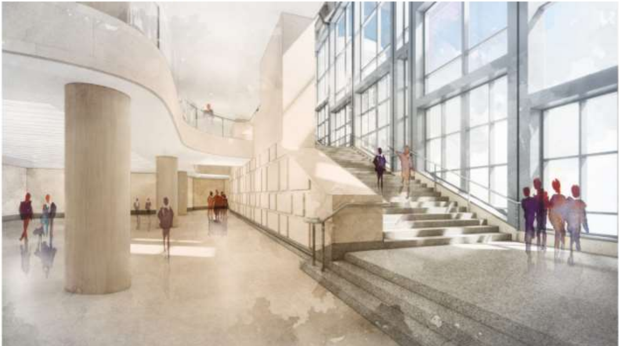
1/18 Selldorf Architects' proposals would bring more light to the Sainsbury Wing entrance and make it easier for visitors to navigate.