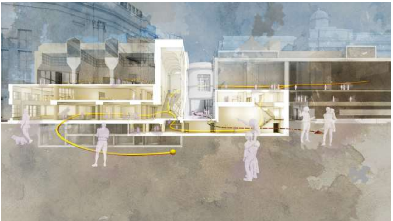
Proposed loop connection for the Sainsbury Wing.

The initial phase of works at the Sainsbury Wing is set to complete in 2024.