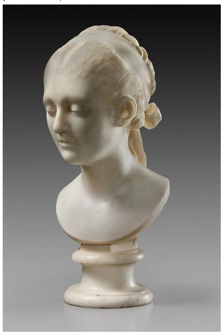
Jean-Antoine Houdon's marble bust "Little Lise" (1775) will soon reside at the Clark Art Institute.