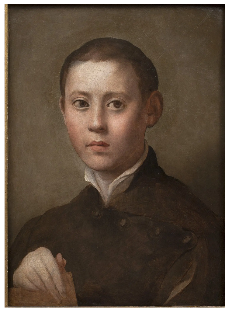
Jacopo da Pontormo's "Portrait of a Boy," circa 1535–40 or later, oil on fired tile.

The donation will give the Clark its first works by more than 100 artists, including the 16th-century Italian painter Jacopo da Pontormo ("Portrait of a Boy," circa 1535-40) and Bernini, who is considered to be one of the greatest Italian sculptors of the 17th century (two works, one of which is the bronze "Countess Matilda of Canossa," circa 1630-39).