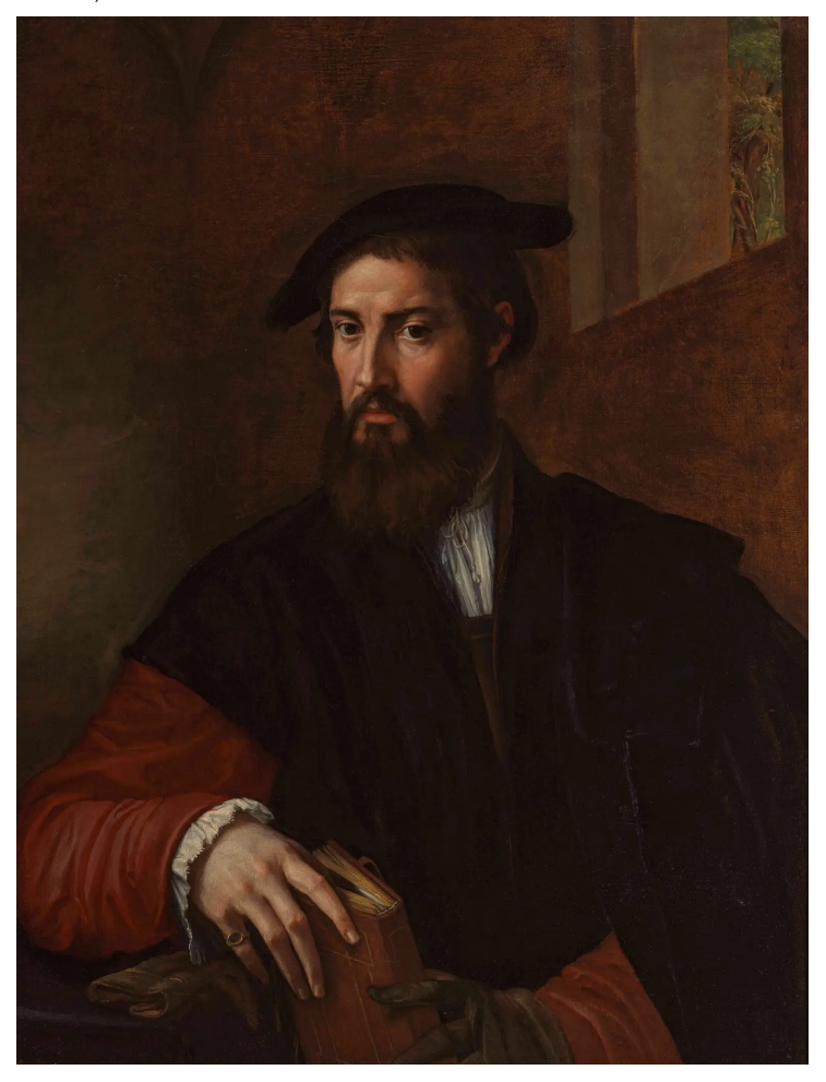
Parmigianino's "Portrait of a Man," circa 1530, oil on canvas. via Clark Art Institute, Williamstown, Massachusetts