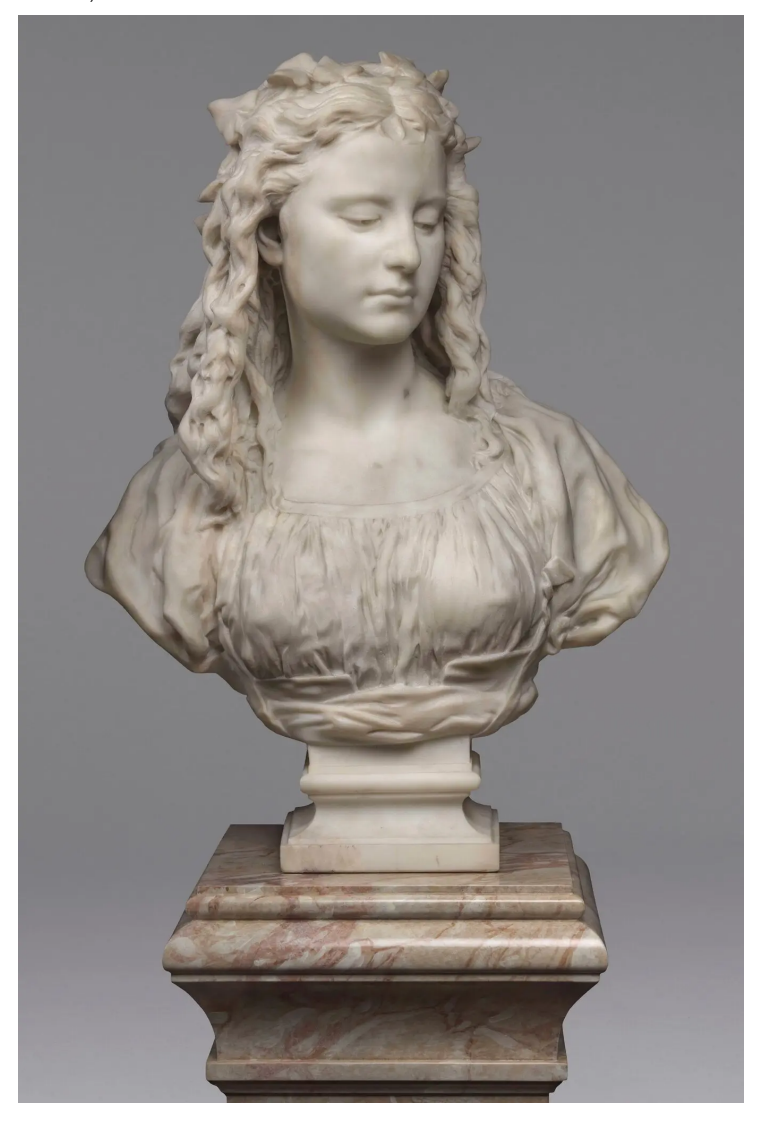
"La Candeur," a marble bust by Jean-Baptiste Carpeaux from 1873, was included in the gift.