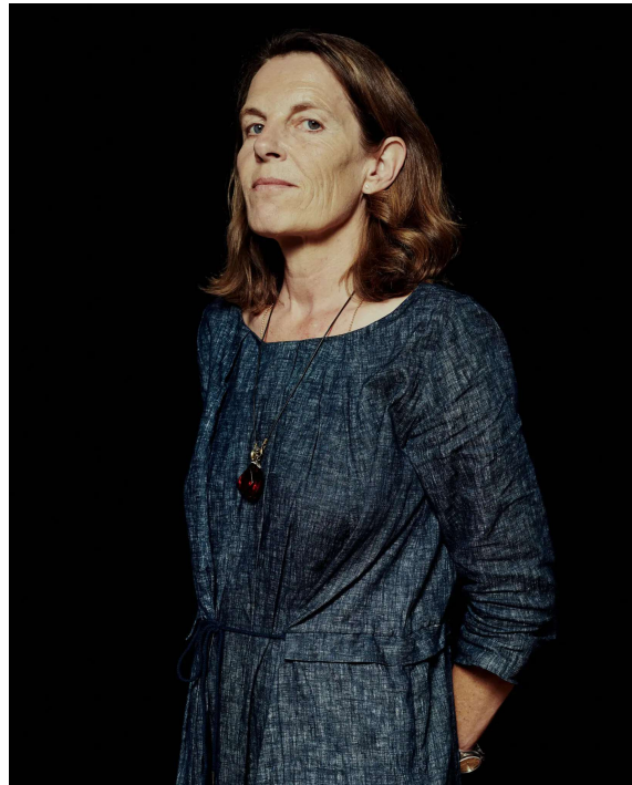
Annabelle Selldorf, architect of the new Shaker Museum.

The collection, which is online, has been physically housed in somewhat dilapidated farm buildings and has not been on public view for a decade. The new $18 million complex will house a conservation and storage facility, permanent and rotating exhibitions, a public reading room and a community space. Ms. Selldorf, who is something of a court architect to the art world, has designed a series of glass links to connect the old and new structures. These will open up to a Shaker-inspired landscape by the firm Nelson Byrd Woltz made up of medicinal and native plants and a small garden of concentric circles loosely based on Shaker dances. Ms. Selldorf's renderings, along with a few stellar pieces, are currently on view in "The Future is a Gift," a pop-up exhibition in Chatham, a village located close to the Shaker heartlands of New Lebanon, N.Y. and Hancock, Mass.