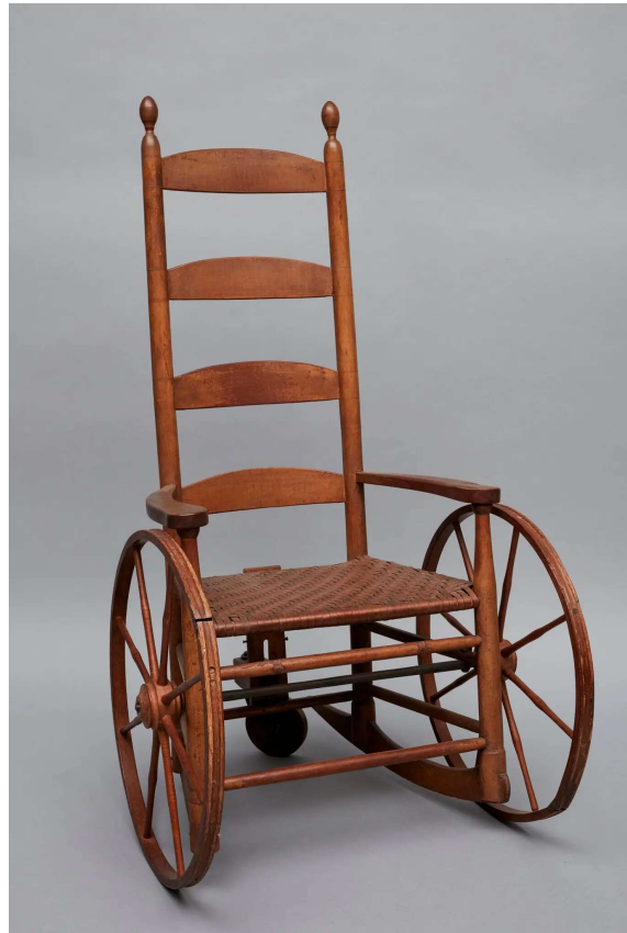
Wheelchair made from a modified rocking chair, ca. 1830, one of the collections' more intriguing artifacts. Shaker design accommodated disabled people.