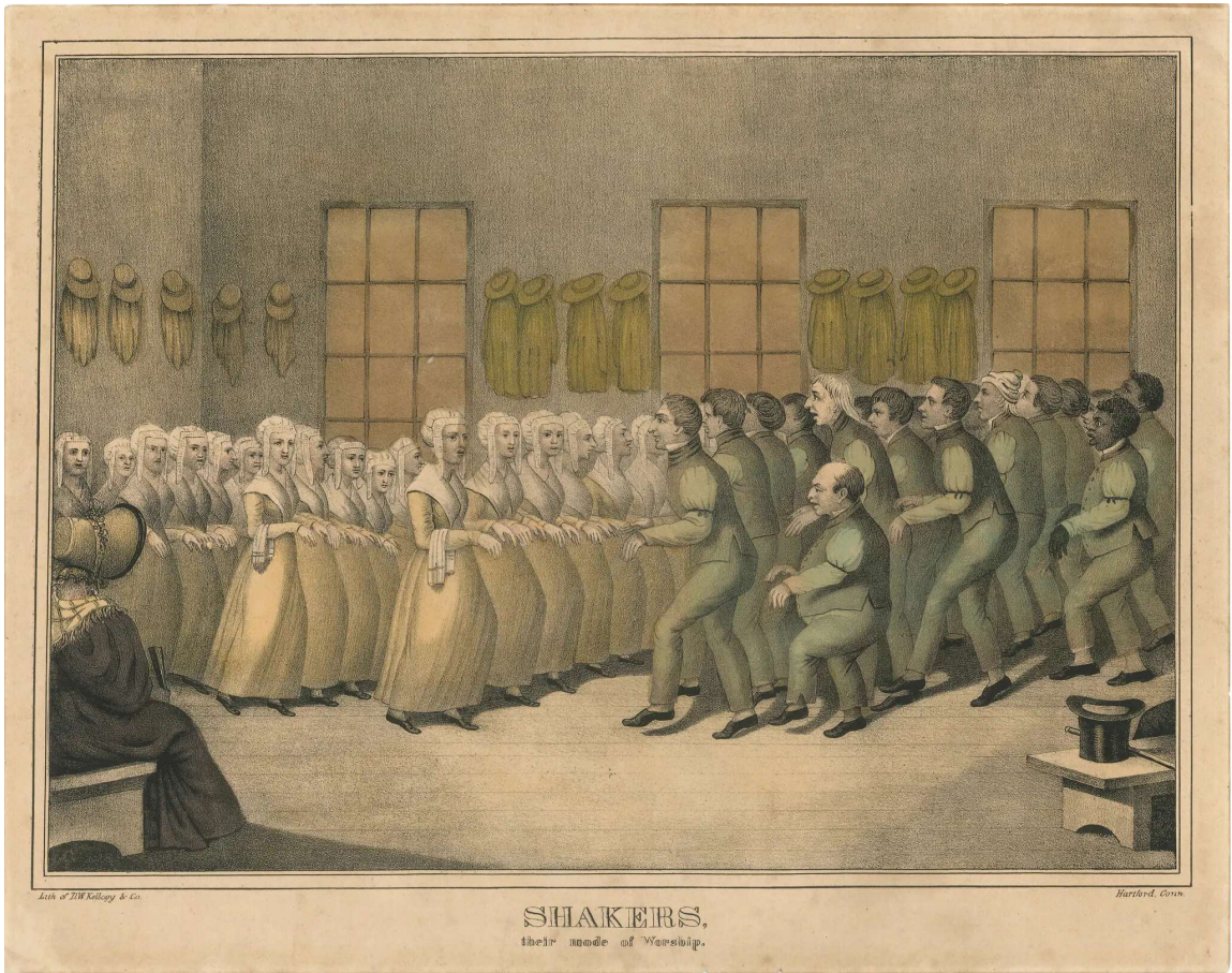
Lithograph, "Shakers, their mode of Worship," ca. 1835, Shaker Museum.