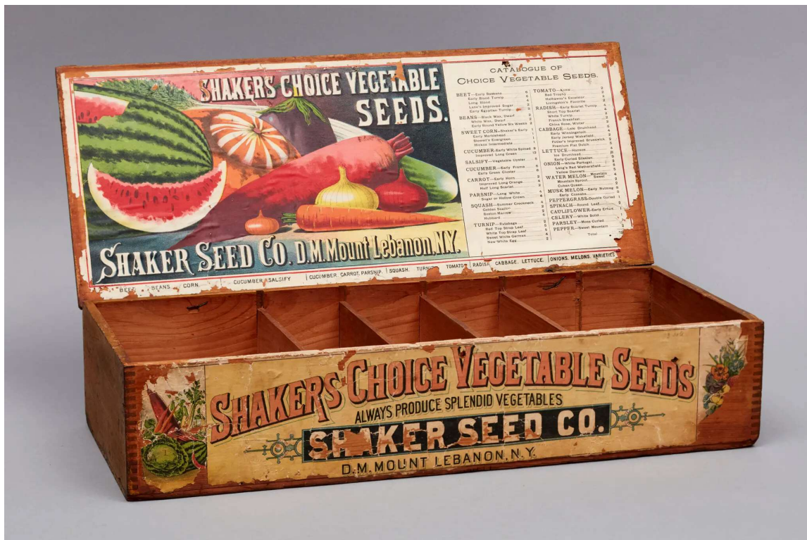
Box for consignment of garden seeds, ca. 1860, in the Shaker Museum.