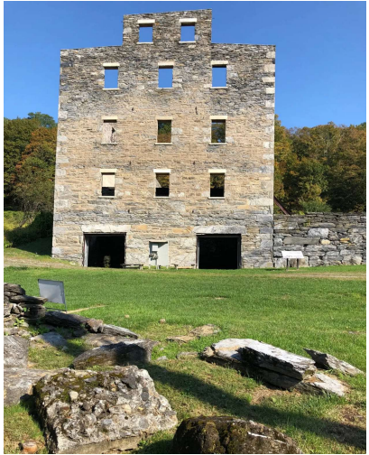
The shell of the Great Stone Barn on the historic site in New Lebanon, formerly Mt. Lebanon.

The 30,000 visitors a year who are projected to visit the museum will be a boon to Columbia County, where some 15 percent of the housing stock consists of second homes typically owned by weekend New Yorkers. It seems likely to spark a Shaker tourism circuit that would include Hancock Shaker Village in nearby Pittsfield, Mass., a living history museum that has an archetypal Round Barn, baby animals and goat yoga.