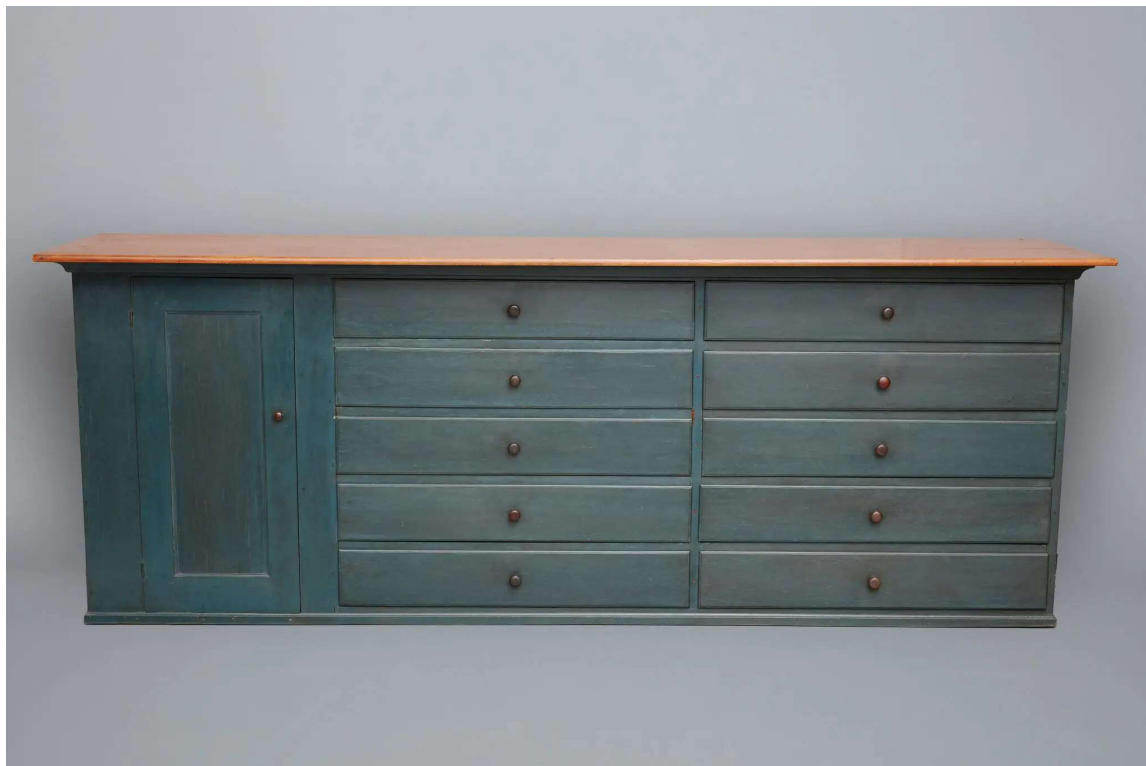
Pine tailor's counter painted blue, ca. 1815, in the Shaker Museum. New exhibitions will go beyond the visual to focus on the human aspects of the furniture, including sustainability and gender equality.

The spare, modernistic furnishings for which the Shakers are best known are typically exhibited for their aesthetics. These pieces were not intended for individual use, however, but rather shared among groups or men and women. Time has shed light on a pine wheelbarrow featured in the 1986 “Shaker Design” show at the Whitney Museum, which was said to be used for clearing land: Research has shown it hauled boxes of medicine. The idea will be to go beyond the visual to focus on the human aspects of the furniture.