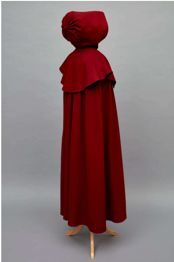
A wool felt cloak labeled “E. J. Neale and Company,” ca. 1910-1930, Church Family, Mount Lebanon is part of the collection of the Shaker Museum.