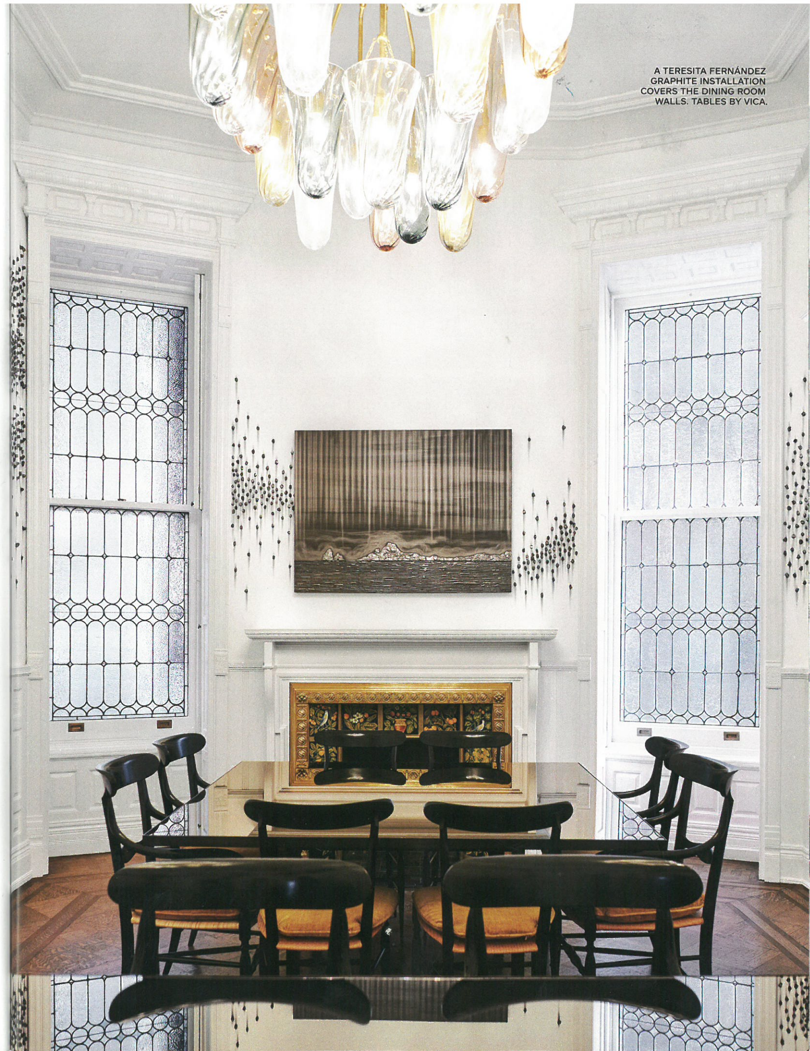
A TERESITA FERNÁNDEZ GRAPHITE INSTALLATION COVERS THE DINING ROOM WALLS. TABLES BY VICA.