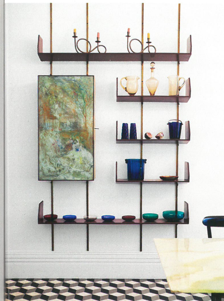
ABOVE LEFT IN THE KITCHEN, A VINTAGE SHELVING SYSTEM BY OSVALDO BORSANI CONTAINS AN INTEGRATED BAR BY ADRIANO DI SPILIMBERGO. ABOVE RIGHT A FORNASETTI FOR COLE & SON WALL COVERING ANIMATES THE GIRLS’ BEDROOM.