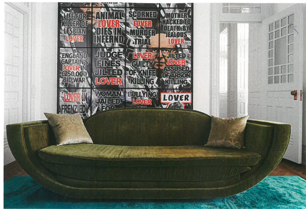
LEFT A CUSTOM SOFA IN THE LIBRARY. GILBERT & GEORGE ARTWORK. BELOW A HERNAN BAS PAINTING HANGS ABOVE THE ORIGINAL MANTEL. ON WILLIAM HAINES TABLE, KLARA KRISTALOVA SCULPTURE. OPPOSITE EXPANSIVE AMUNEAL SHELIVING COVERS A WALL OF THE LIBRARY. VINTAGE CLUB CHAIR AND COCKTAIL TABLES.