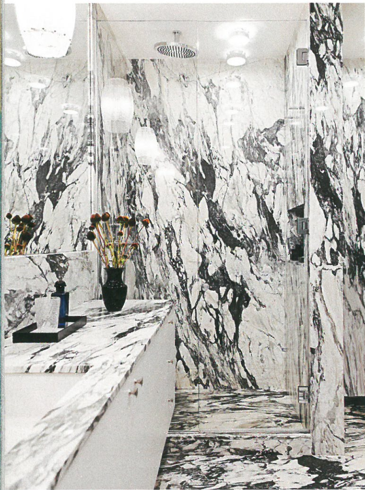
CLOCKWISE FROM ABOVE THE CALACATTA PAONAZZO MARBLE-CLAD MASTER BATH. A CATHERINE OPIE PORTRAIT OF MAURA AND ISABELLA. IN THE MASTER BEDROOM, A GIAMBATTISTA VALLI STRIPED SILK COVERS THE BED AND DAYBED PILLOWS.