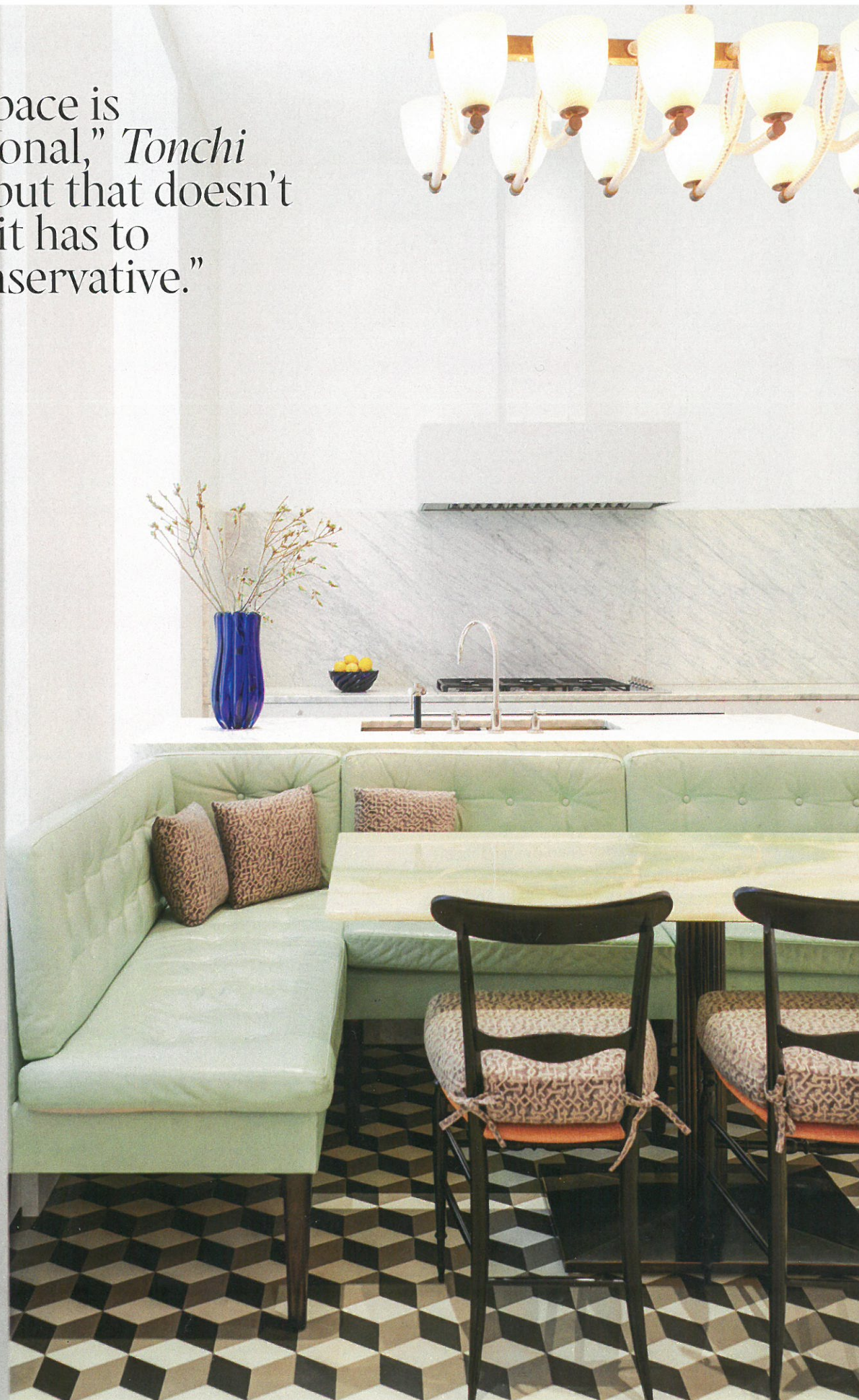
THE KITCHEN BANQUETTE WEARS A MOORE & GILES LEATHER. LEVAGGI CHAIRS; SEAT CUSHIONS AND PILLOWS OF FORTUNY FABRICS; CONCRETE FLOOR TILES BY CLÉ.